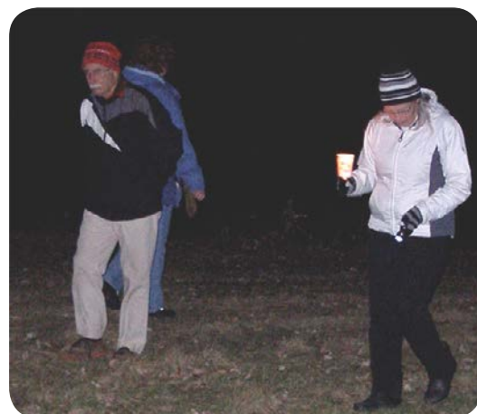
Walking the Labyrinth by candlelight.