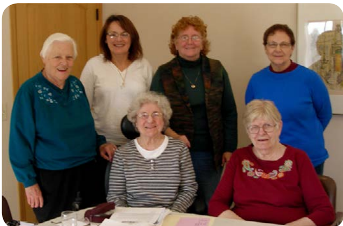
SCL Board members pose for group picture after their November meeting.